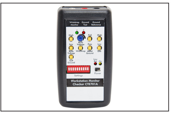
Figure 3. SCS CTE701 Workstation Monitor Checker

The checker verifies the proper operation of dual wrist strap monitoring. Connect a 3.5 mm test cable to both the checker and to the operator jack of the monitor. At this point the monitor should indicate failure. Depress the Pass button on the wrist strap section. The monitor should indicate a good connection. While pressing the Pass button, press body voltage "high." At this point the Wrist Strap LED would be blinking red.