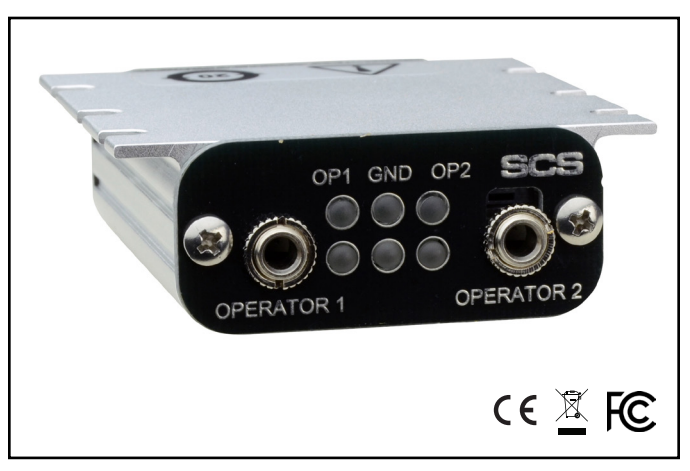
Figure 1. SCS CTC337 Wrist Strap and Ground Monitor