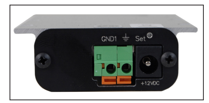
Figure 2. Rear view of Wrist Strap and Ground Monitor

Attach 18 AWG wires to the unit as described below. Strip back the vinyl insulation at each end of the wires to approximately 1/3 inch (8 mm). Twist the stranded wire on each end before inserting the wire into each connector location. In order to attach the wire, insert a small blade screwdriver into the orange slot above. Gently push inward and insert the stripped wire fully into the hole in the green connector. Hold the wire fully in and release the screwdriver to allow the wire to catch. Attach the green monitor ground cord to the ground connector on back of unit. Attach the impedance monitor wire to the "GND1" connector on the back of the unit.