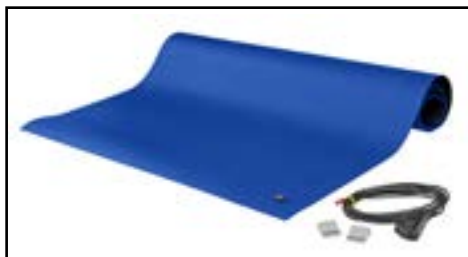
8900 Table Mat Kit shown with included hardware